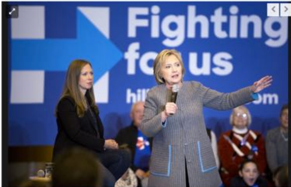
Democratic presidential candidate Hillary Clinton speaks as her daughter Chelsea Clinton, left, and the crowd listen during a campaign event at Sioux City Convention Center in Sioux City on Sunday night.